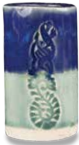
PC-23 Indigo Float over C-22 Fog