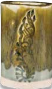
PC-53 Ancient Jasper over C-22 Fog