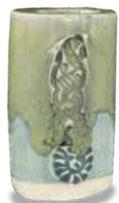
PC-32 Albany Slip Brown over C-22 Fog