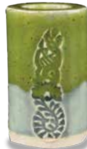
PC-29 Deep Olive Speckle over C-22 Fog