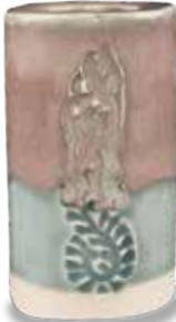
PC-43 Toasted Sage over C-22 Fog