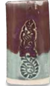
PC-57 Smokey Merlot over C-22 Fog