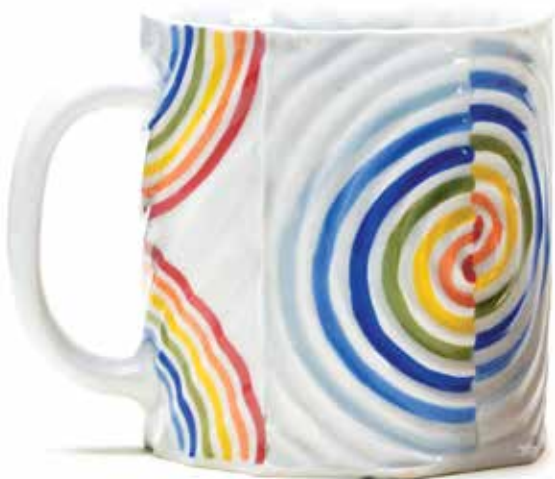
5 Judi Tavill's Coastal Waves Vessel Ivory , 6 in. (15 cm) in width, wheel-thrown and altered stoneware, 2018. 6 Crystal Nykoluk's Folding Sea , 9 in. (23 cm) in diameter, slab-built porcelain, celadon glaze, flashing slip, salt and wood ash, 2010. "The Sculptural Vessel," at Clay Center of New Orleans ( www.nolaclay.org ) in New Orleans, Louisiana, through December 29. 7 Blair Clemo's mug, 4½ in. (11 cm) in width, wheel-thrown and altered porcelain, underglazes, clear gloss, high fired. 8 Melanie Sherman's cup and saucer, to 5 in. (13 cm) in width, wheel-thrown porcelain, glaze, lusters, decals, fired multiple times at multiple temperatures from cone 10–017. "Reinventing the Classics—Modern Functional Ceramics Based on Historic Styles" at In Tandem Gallery ( www.intandemgallery.com ) in Bakersville, North Carolina, through December 31.